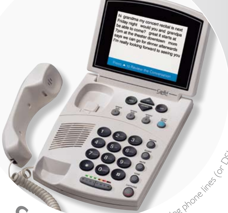
CapTel 800 – for use with analog phone lines (or DSL with filter)